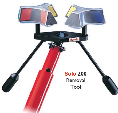
Solo 200 Removal Tool