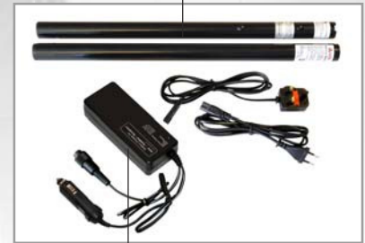
Solo 726 Fast Charger