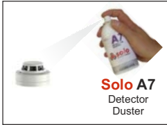
Solo A7 Detector Duster