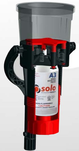
Solo 330 for use with Solo A3 & C3 Aerosols

Solo 332 is available for larger diameter detectors.