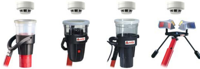
Solo 330 Aerosol Dispenser